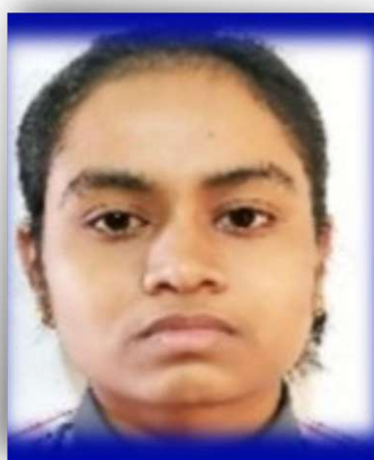
Bias Das JEE Mains 89.87%tile